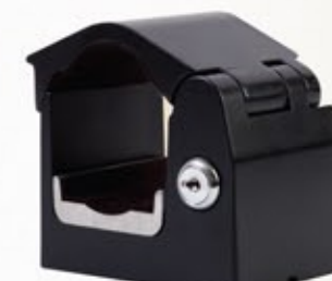
ELS-620-B (Standard Key shown) Large weapon Lock. Shown with adjustable plate.