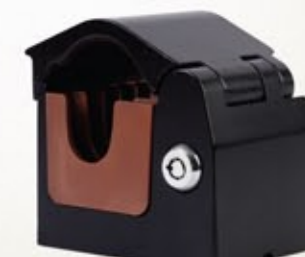
ELS-620-R (Barrel Key shown) Large weapon Lock. Shown with ELS-310 insert.