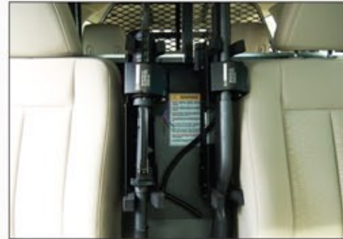
VMB Mount - (With Partition)

For vertical mounting on existing partitions or flat surfaces.