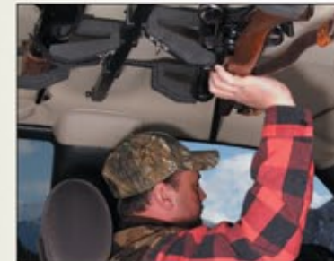
Model SBR-2G - Horizontal Mount 2 Gun Rack

SBR Series mounts are available in two basic models: SBR-2G (2 Gun) and SBR-1G (1 Gun) mounts. Also available for both SBR models is the SBB-U utility bracket set which provide optimal storage and easy access for your small accessory items (fishing rods, flashlight, etc).