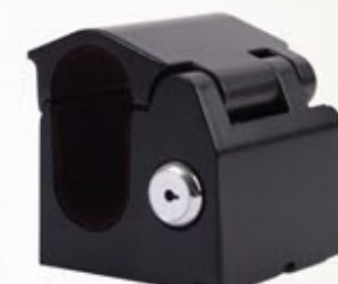
ELS-610-A (Handcuff Key shown) Lock for Pump Shotguns.

Just need locks? Buy the best—the ELS-600 Series. Includes push button switch. All locks are available with key override; (A) Handcuff; (B) Standard/Flat; (R) Barrel