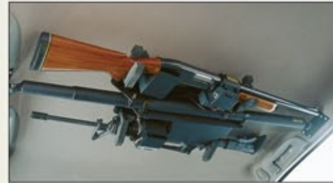
UCB Mount - Can Accommodate 2 Rack Models

For use with vehicles without partitions. The bar is attached by use of self-drilling screws into inner headliner side panels. Includes UCB telescoping bar and adjustable mounting brackets. UCB mounts will accommodate all ELS Racks, in 1 or 2 gun configurations. UCB Mount is not compatible with vehicles having Side Curtain Airbags.