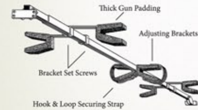
Telescoping Bar with Adjustable Gun Brackets

SBR Series mounts are available in two basic models: SBR-2G (2 Gun) and SBR-1G (1 Gun) mounts. Also available for both SBR models is the SBB-U utility bracket set which provide optimal storage and easy access for your small accessory items (fishing rods, flashlight, etc).