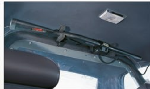
RB Mount (With Roll-Bar Partition)

Specially manufactured u-bolt / saddle for mounting to partitions with roll bars, padded or non-padded. Also used with UCB bar.