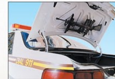
Model BSR-1 (trunk mounting shown)

All original BSR Racks are intended for direct roof mounting. Vehicles without double-wall construction will require through-the-roof or through-the-sidewall mounting.