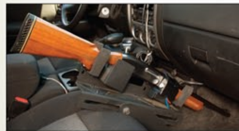
Floor Mount Bracket

Mounts to the front passenger floor. Elongated slot allows the weapon location to adjust by sliding forward and back; tilt up and down. Accommodates any ELS Model.