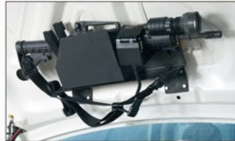
TLB Mount - (On Trunk Lid)