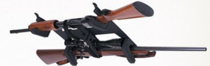
Model BSR-2 - Mount for 2 Guns