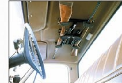
Model BSR-2 (overhead truck mounting shown)

The two original BSR Racks are the BSR-2 Model (a two gun model for overhead, horizontal mounting) and the BSR-1 Model (a one gun for horizontal or vertical mounting).