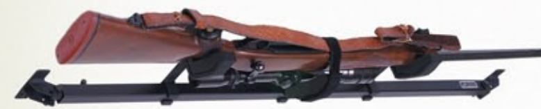
Model SBR-1G - Mount for 1 Gun